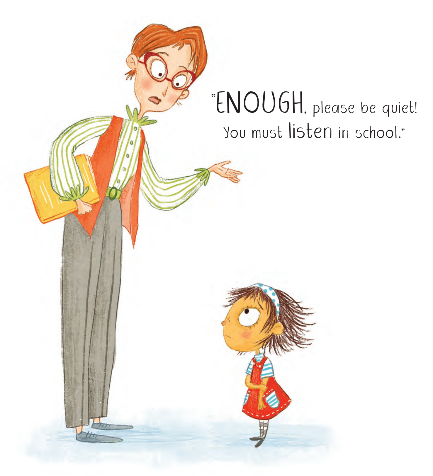
But silence in class is a terrible rule!

but my teacher gets angry and then ends up Snapping.